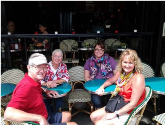
Lunch at the Notre Dame cafe ...