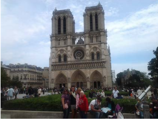
Girls posing in front of the Notre Dame cathedral.